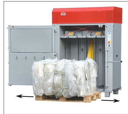
The main door of the NP80P-II can be fully opened (180°) so that the bale can be easily removed even in small spaces.