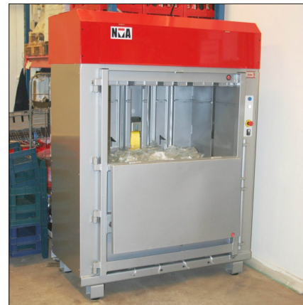
The feed door is opened 90° as standard but can be opened all the way down 180°, adjusted to your needs.