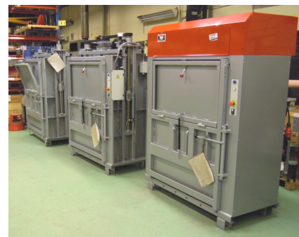
Since the mid-sixties more than 15,000 balers have been delivered all over the world.