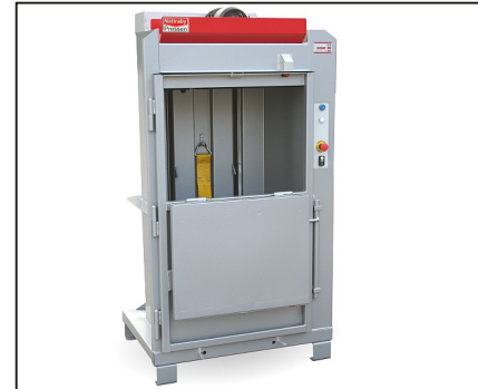
The feed door opens 90° as standard, but can be opened all the way down 180° for customized needs.