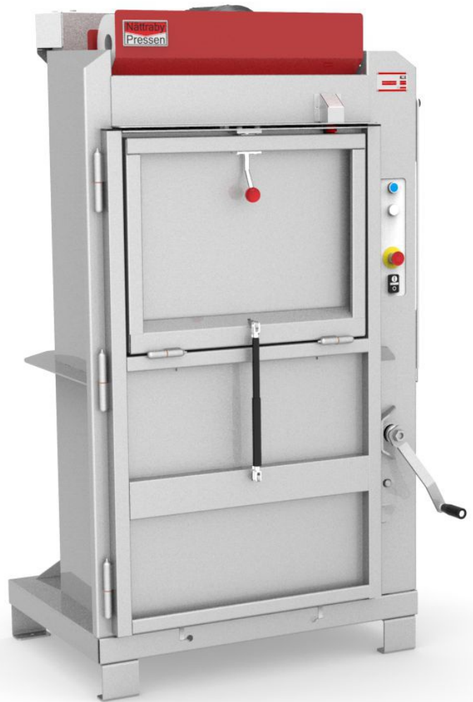
Thanks to its low height, the NP40-II can be placed near the source and can easily be relocated with a pallet truck by changing needs.