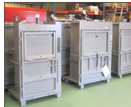
Since the mid-sixties more than 15,000 NVA balers have been delivered all over the world.